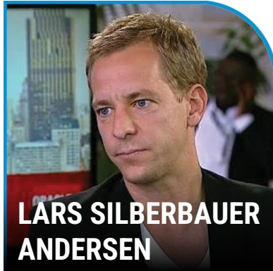
Senior Global Director of Social Media & Video, LEGO