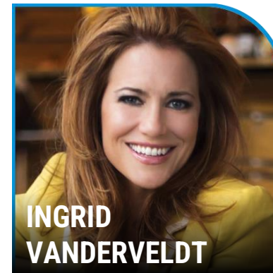
Founder, Chairman & CEO of Vanderveldt Global Investments, EBW2020 LLC