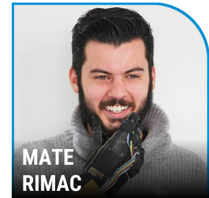
CEO at Rimac Automobili