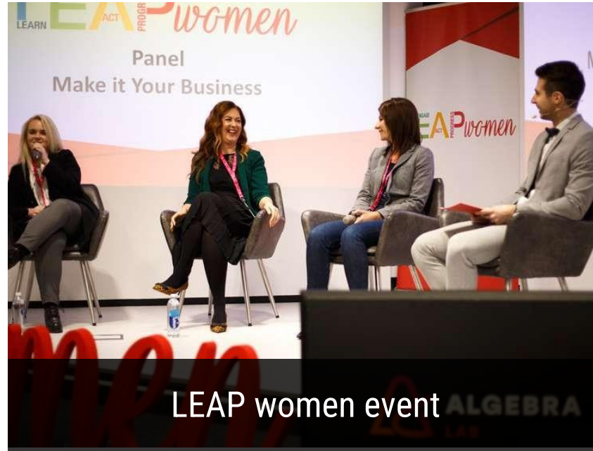
LEAP women event