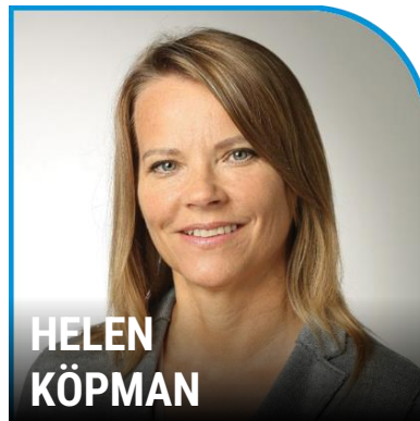
Deputy Head of Unit Digital Innovation and Blockchain - European Commission