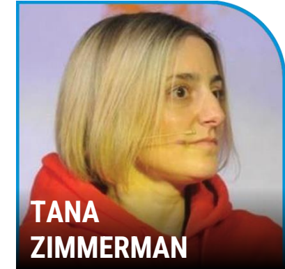
CEO & Co-founder at Bazaar