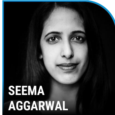
Marketing Manager, Disney