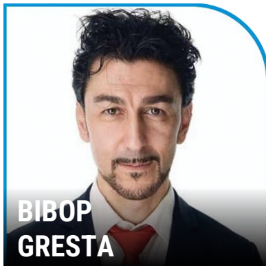
Co-Founder and Chairman of Hyperloop Transportation Technologie