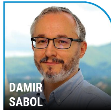
Founder and CEO at Photomath